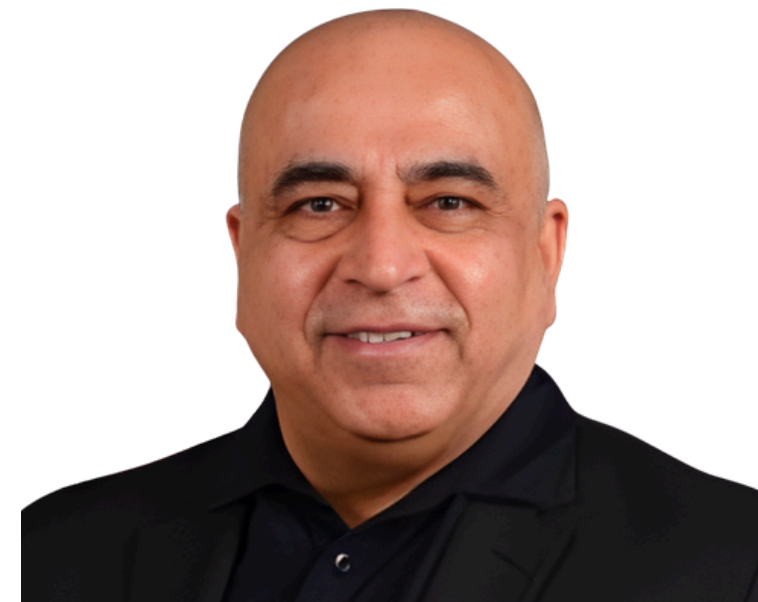
Deepak Sachdeva CIO United States Airforce